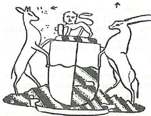
GROUP 3 - WITH A MINOR VARIETY